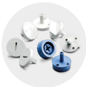
Quick locking cover screws for fast access to components